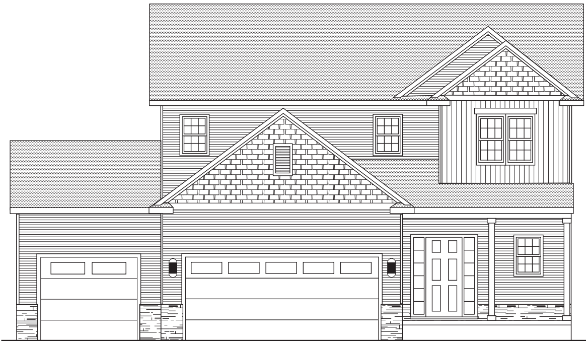
3RD BAY BUMP-OUT OPTION